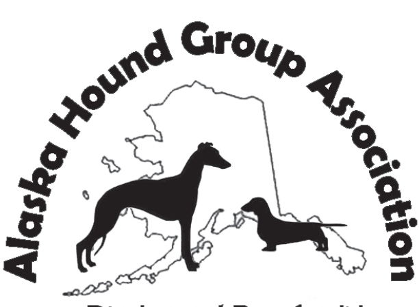
Dia In and Run for It!