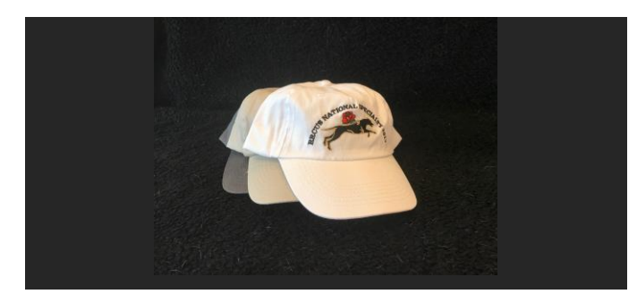
Caps Cotton Twill: White, Light Khaki, Gray - $15 ea