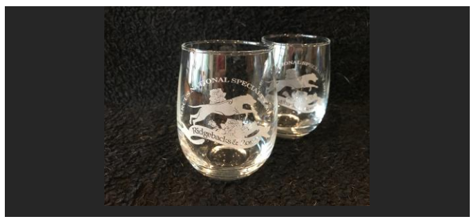
13 oz. Stemless Wine Glasses - $10 ea