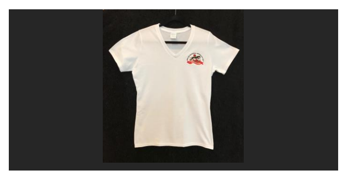
Embroidered V-Neck Women's Cotton Tee S, M, L, XL, XXL – $30 ea