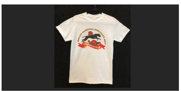
Unisex Full Color Cotton Logo Tee S, M, L, XL, XXL, XXXL - $20 ea