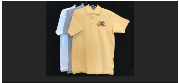
Embroidered UnisexCotton Pique Polo White, Gray, Maize: S, M, L, XL, XXL - $40 ea