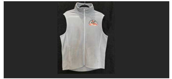
Embroidered Unisex Microfleece Vest Gray: S, M, L, XL, XXL - $45 ea