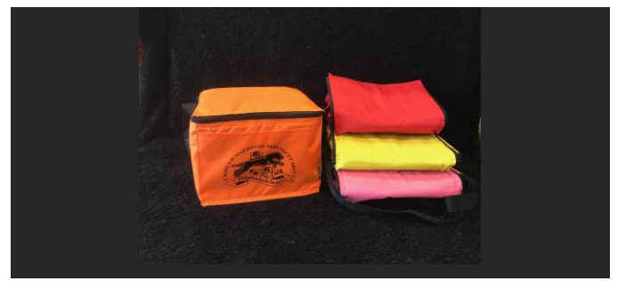
Koozie 6-Pack Cooler Red, Orange, Pink or Yellow - $15 ea