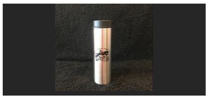
16 oz. Travel Tumbler Brushed Stainless Finish - $20 ea