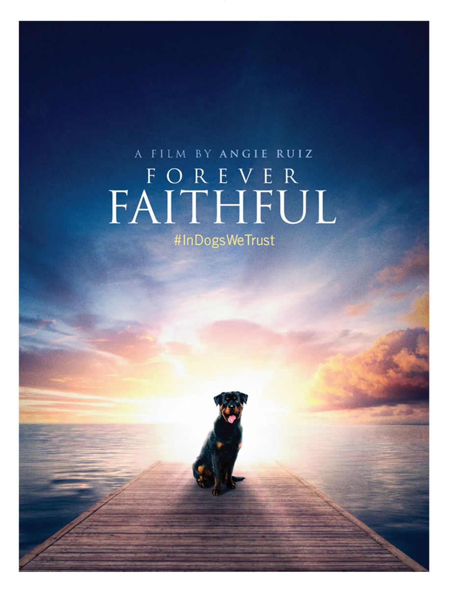
There will be a complimentary showing of "FOREVER FAITHFUL" during the national. Please stay tuned for the date & time.