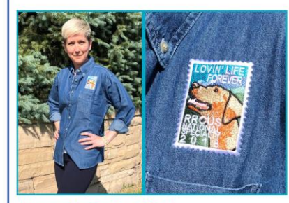
Women's Denim Shirt

This long-sleeve denim shirt is made with 7-oz, 100% cotton. Fabric is sandwashed for extra softness and to reduce shrinkage. Left chest pocket.