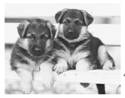
FREE Available to all Junior Exhibitors

Check at the Superintendent's Table for Ring Location and specific time